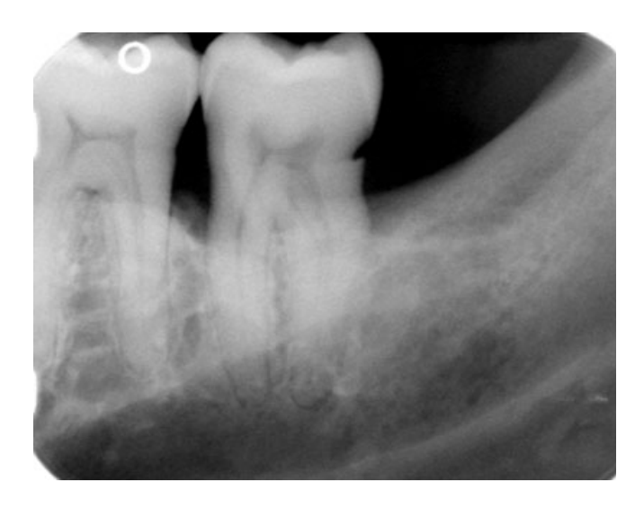
Fig. 2. Radiograph of mandibular left 2nd molar (no. 18) showing 'V'-shaped notch-like defect on distal surface.