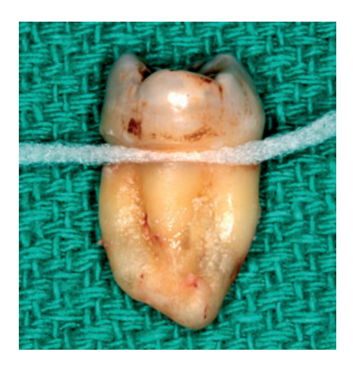
Fig. 4. Extracted tooth no. 16 with floss inserted into the linear notchlike defect demonstrating a tight fit that facilitated the sawing action.

molars were inspected to insure that caries had not involved the linear notch-like defect.