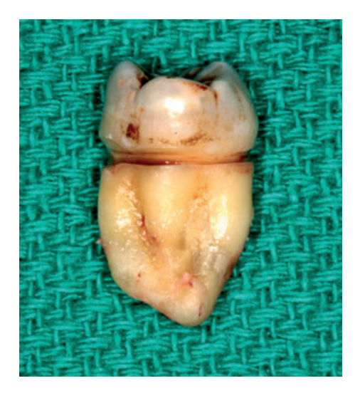
Fig. 3. Extracted tooth no. 1 showing the extensive linear notch-like defect resulting from 'sawing' with dental floss.

with aggressive horizontal toothbrushing. When asked to demonstrate his flossing technique, the patient passed the floss between his molars, slipped it into the distal abrasion defect (Fig. 4) and held the extended threads parallel to one another. Once in place, he flossed using a sawing action. The patient stated that he had used this technique daily for many years.